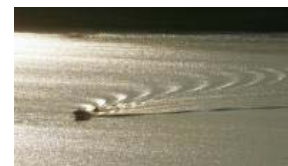
The largest dam in Santa Clara County, at Anderson Reservoir, could collapse... (Patrick Tehan)

officials emphasized that the dam is safe. But they said they will not allow its water level to come within 30 feet of the top — leaving the reservoir no more than 87 percent full — for at least 18 months while more detailed engineering studies are done.